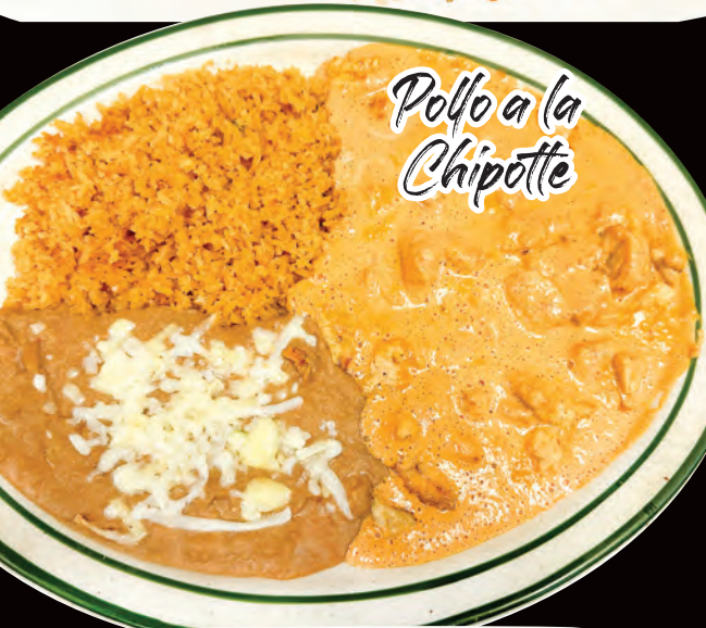
Pollo a la Chipotle