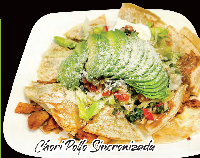
Chori Pollo Sincronizada

A 10-inch quesadilla with steak, grilled chicken, shrimp, bell peppers and grilled onions. Served with a sour cream salad and rice. 15.50