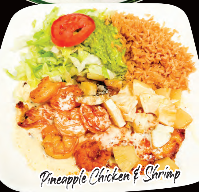
Pineapple Chicken & Shrimp