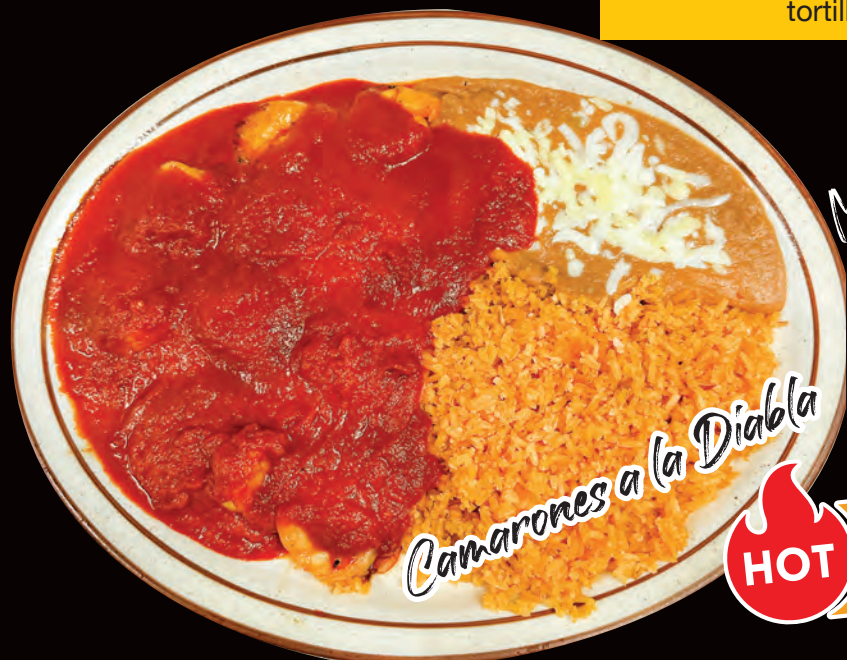
Camarones a la Diabla

Breaded shrimp served with rice, refried beans, tortillas and a salad. 15.50