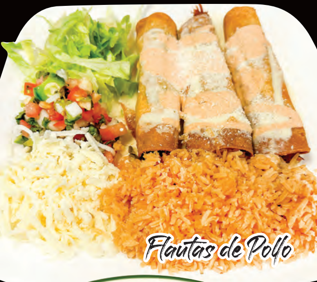
Flautas de Pollo