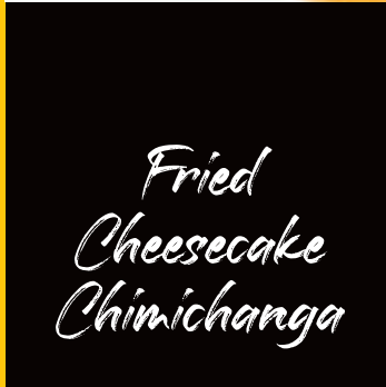
Fried Cheesecake Chimichanga