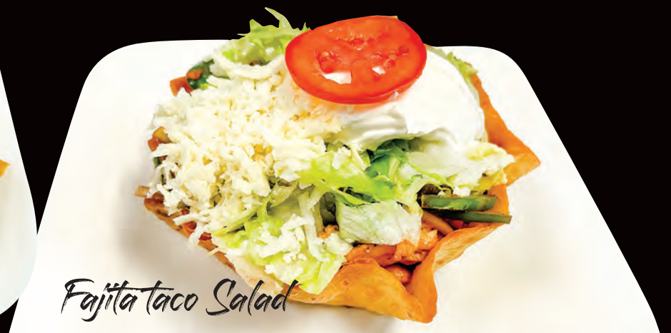
Fajita taco Salad

Grilled fish on a bed of lettuce with tomatoes, onions, bell peppers, cucumbers, purple cabbage and croutons. Topped with cheese. 14.25